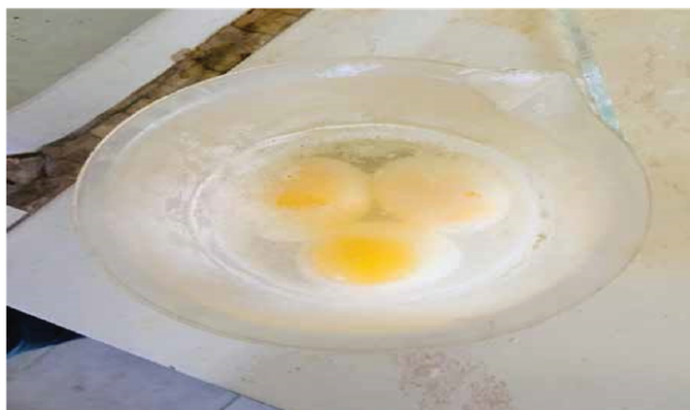
Figure 1: In vitro experimental model setup to evaluate antiurolithiatic activity