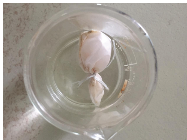
Figure 1(c): Egg membrane along with the contents suspended into the 0.1 M Tris buffer