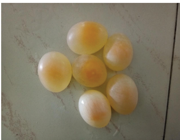
Figure 1(a): Decalcification of egg shell in 10% Acetic acid overnight